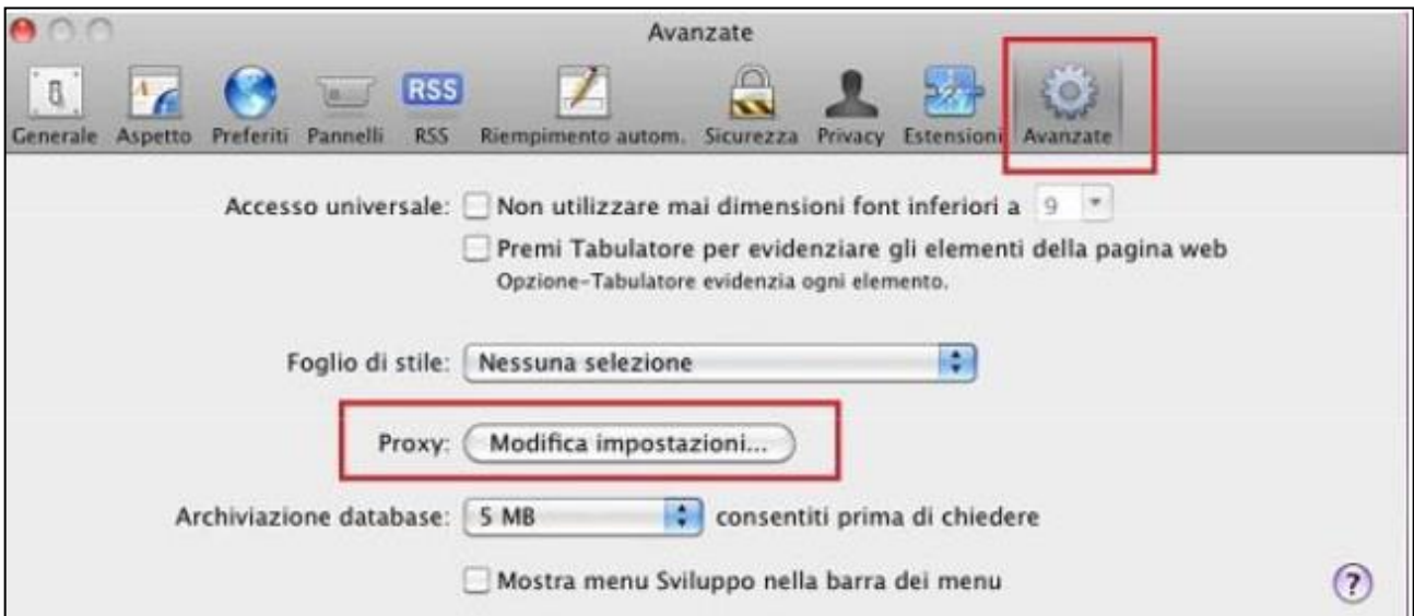
Figure 2 - Advanced - Change settings.