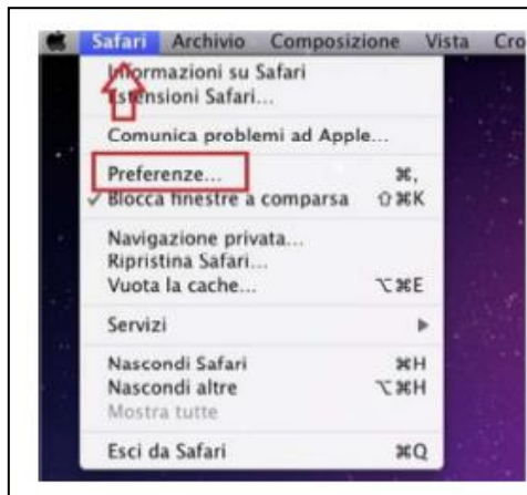
Figure 1 – Preferences